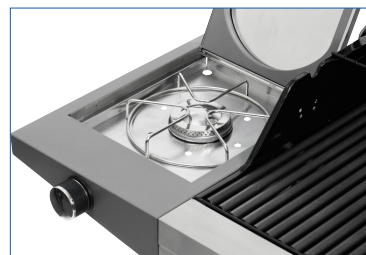
Side burner with pull-up lid; also acts as a table top when down