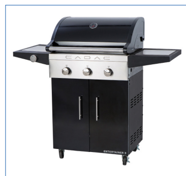
Available in black & stainless steel