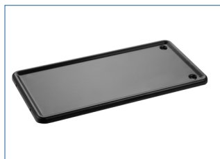
ENAMEL COATED PLANCHA